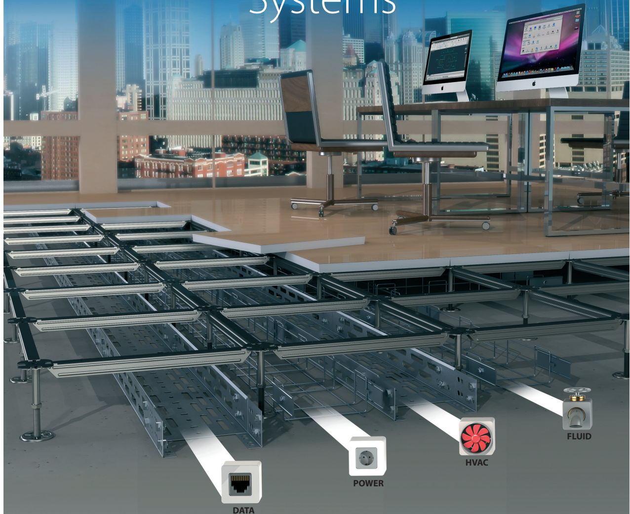
RF60 Panel Fire Resistant